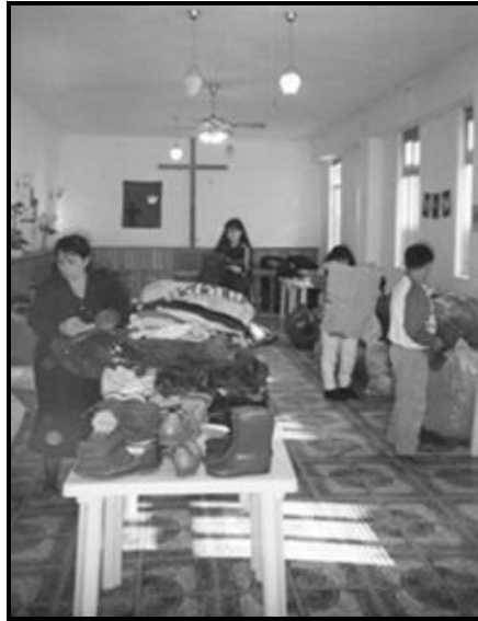
Albanians setting and preparing a distribution center in the sanctuary of the Kombianat Church of the Nazarene near Tirana.